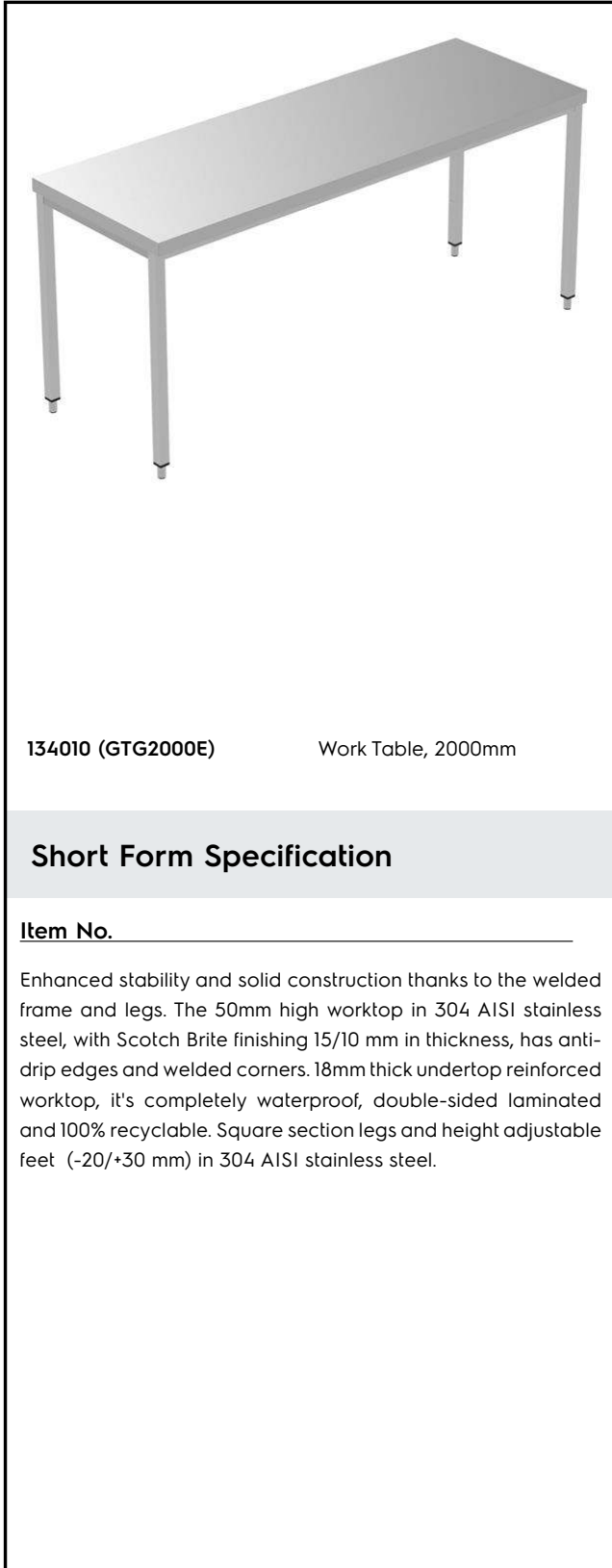
134010 (GTG2000E) Work Table, 2000mm